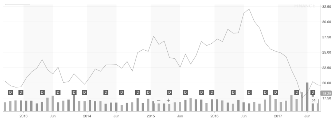
Figure A1: Fundamental stock information (Page 2)

This figure displays an example of the stock information provided to participants in their investment decisions.